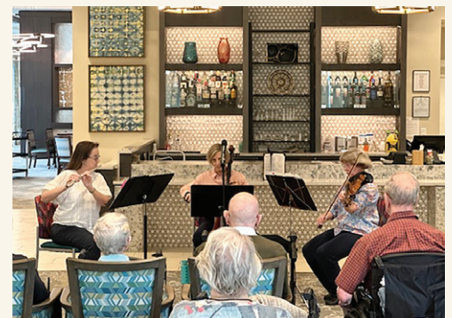
A recent Outreach Program performance