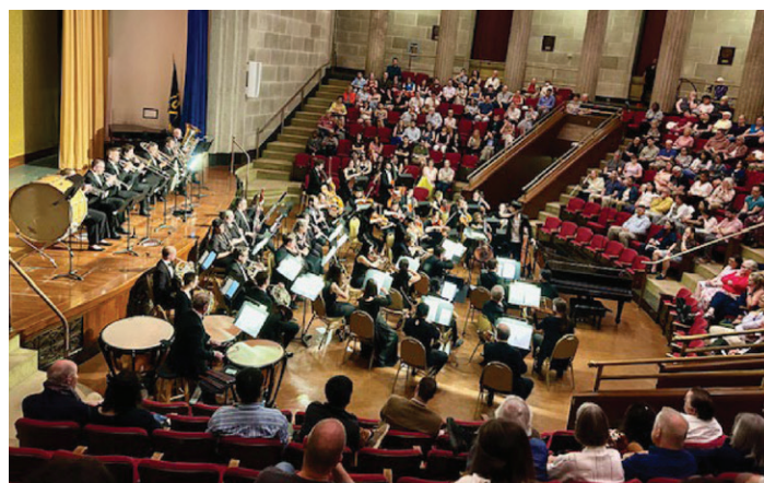
Avanti's May 2025 Concert in Alexandria