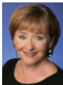
Frederica von Stade